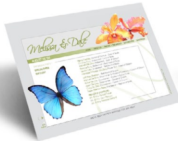
5 dezilva website