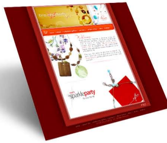
2. Brave Butterfly