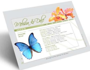
8. Dezilva Website