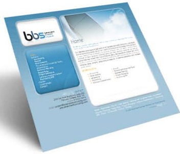
1. Benevolent Business Consulting