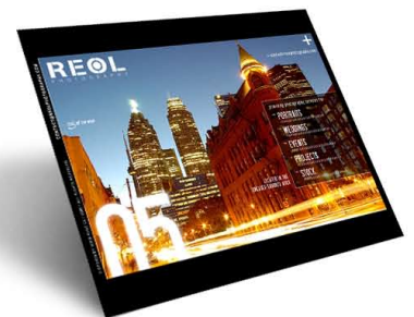
6. Reol Photography