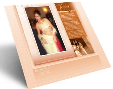
3. Picture it ... Perfect