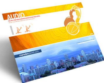
7. Marsden Planet