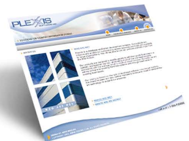
9. Plexis Software Inc.